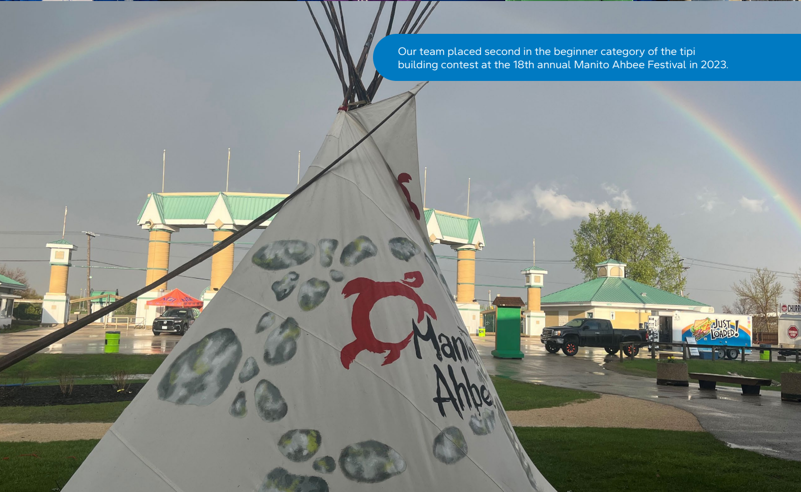
Our team placed second in the beginner category of the tipi building contest at the 18th annual Manito Ahbee Festival in 2023.