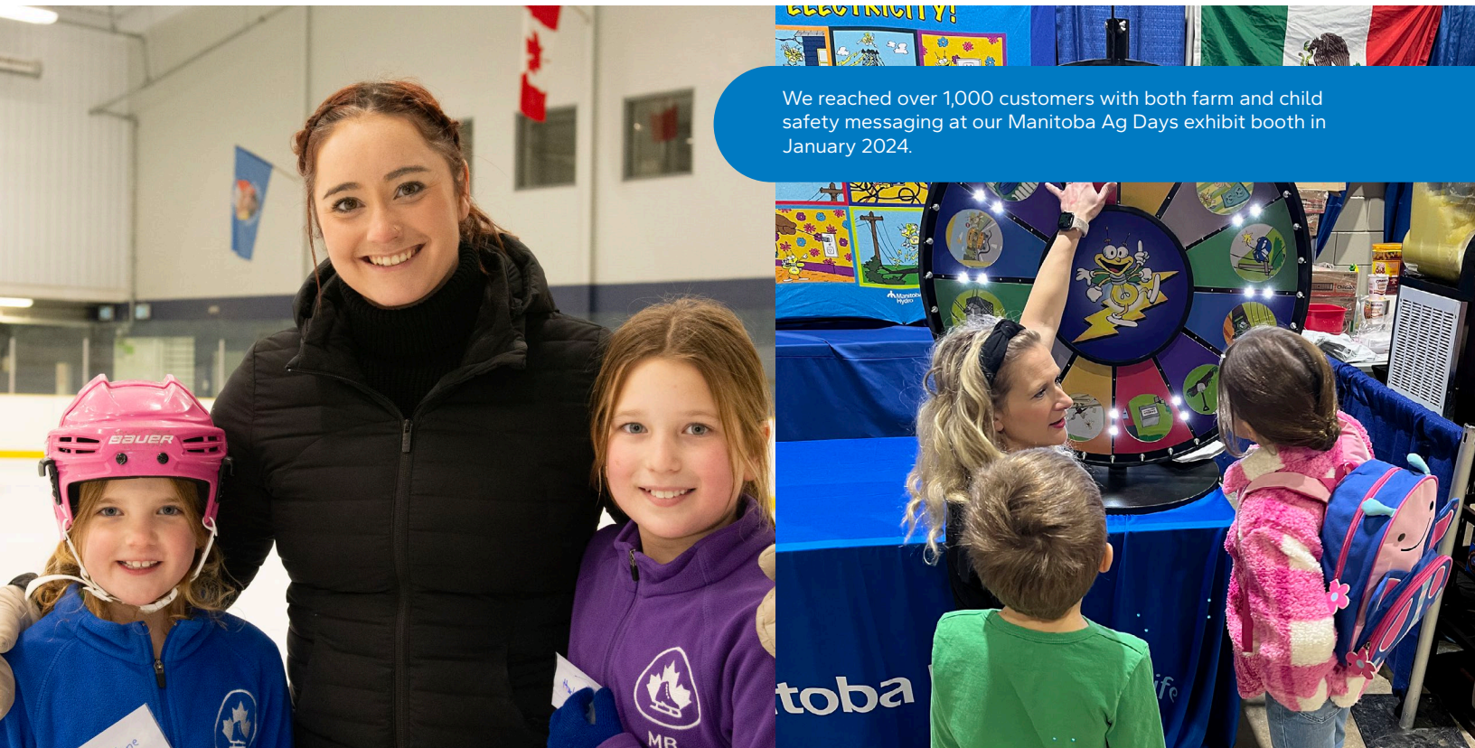
We reached over 1,000 customers with both farm and child safety messaging at our Manitoba Ag Days exhibit booth in January 2024.